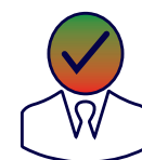
Compatible with Entry Sensors